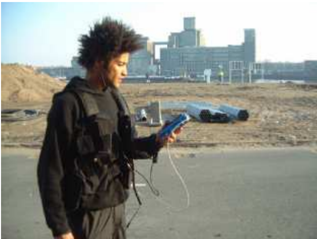
Figure 1. A Street player in CYSMN.

Figure 1 shows a street player and their equipment. Figure 2 shows the online interface, where the black avatar is an online player and the avatar surrounded by a red sphere is a street player. On the bottom of the figure is the text area where online players can communicate with each other and can also send text messages to the street players.