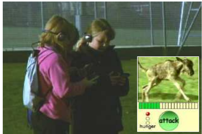
Figure 5. 'Lions' hunting for food as part of the Savannah location-based education game.

Figure 5 shows two lions playing the game with a typical image from the game inset that shows an animal that they have encountered in this particular region of the playing field, along with option to attack it and an indication of their hunger status.