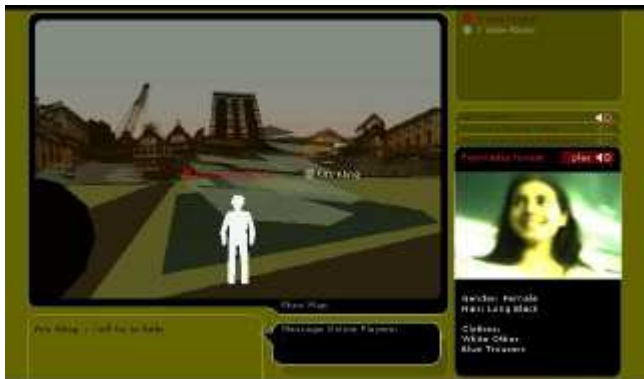
Figure 4. The online interface in Uncle Roy All Around You.

The development and support of Uncle Roy All Around You as it toured drove the design of new authoring tools for pervasive games, including the approach of artists directly colouring over maps to flexibly, rapidly and iteratively author content; new interfaces for orchestrating live events, monitoring players' experiences and intervening from behind the scenes when necessary; and also refining the approach of self-reported positioning in which players declare their own positions to the game through their use of an electronic map [15].