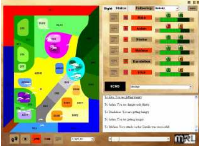
Figure 6. The Den Interface in Savannah.

These three examples illustrate some of the key features and challenges that are distinctive for pervasive games.