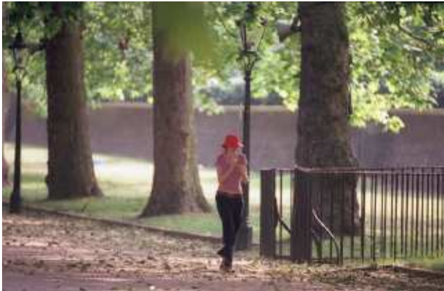
Figure 3. A street player in Uncle Roy All Around You.

Figure 3 shows a street player and figure 4 shows the online interface, including an image of the virtual city model, a card giving details of a street player and the text chat area.