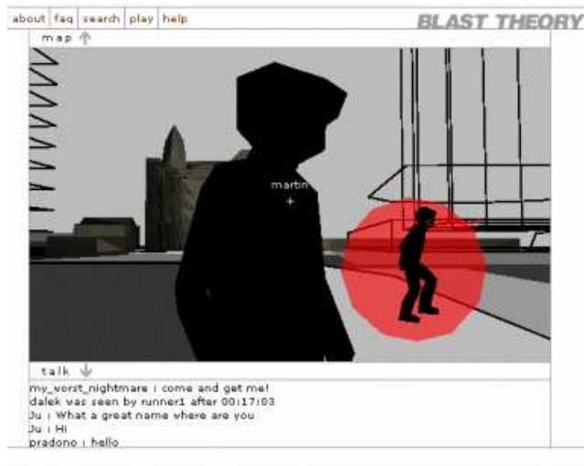
Figure 2. The online interface in CYSMN.

Studies of CYSMN as it toured have revealed key issues for the design and deployment of pervasive games including the