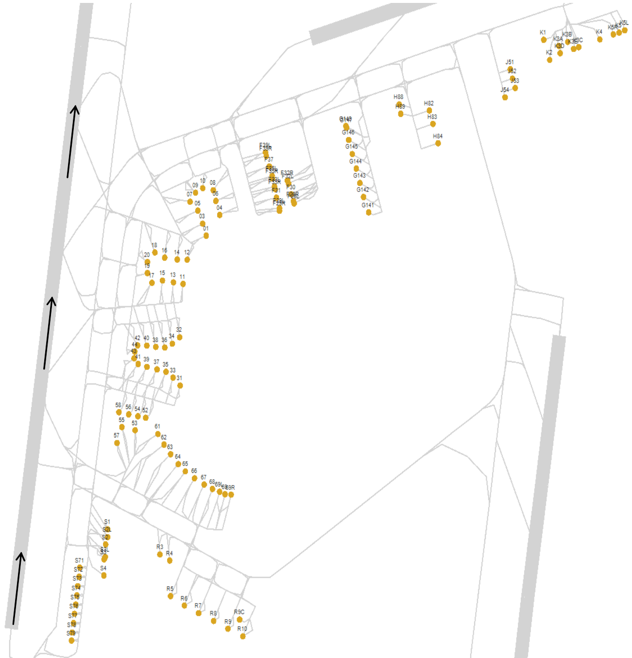
Figure 3. Layout of Arlanda airport

Both routing methods were executed using different instances for Stockholm’s Arlanda airport, the largest airport in Sweden ( http://www.asap.cs.nott.ac.uk/external/atr/benchmarks/index.shtml , accessed 18 November 2015). Instance 1 is based on historical data from the Swedish Air Navigation Service Provider (ANSP) and was the basis for the rest of the instances. It includes 54 aircraft set to depart within 2 hours. Figure 3 is a simple map of the paths and gates that an aircraft can use on Arlanda airport. The gates are highlighted with large dots and the main runway for departures (01L) is highlighted with arrows. Runway 01L is usually used for departures and 01R (right side of the picture) is used for arrivals (or the inverse). Runway 26 (top side of the picture) is newer and used in off-peak conditions so mainly the departure runway is shown in the figure.