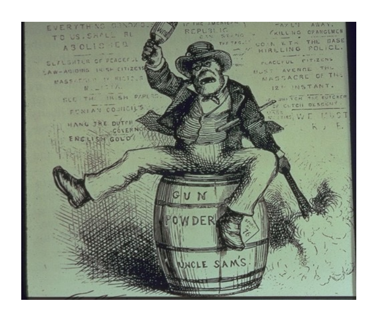
Thomas Nast's cartoon 'The Usual Irish Way Of Doing Things', from Harpers Weekly, 2 September 1871

Thomas Nast's cartoon 'Killing the Goose that laid the Golden egg', from Harper's Weekly , 18 November 1871