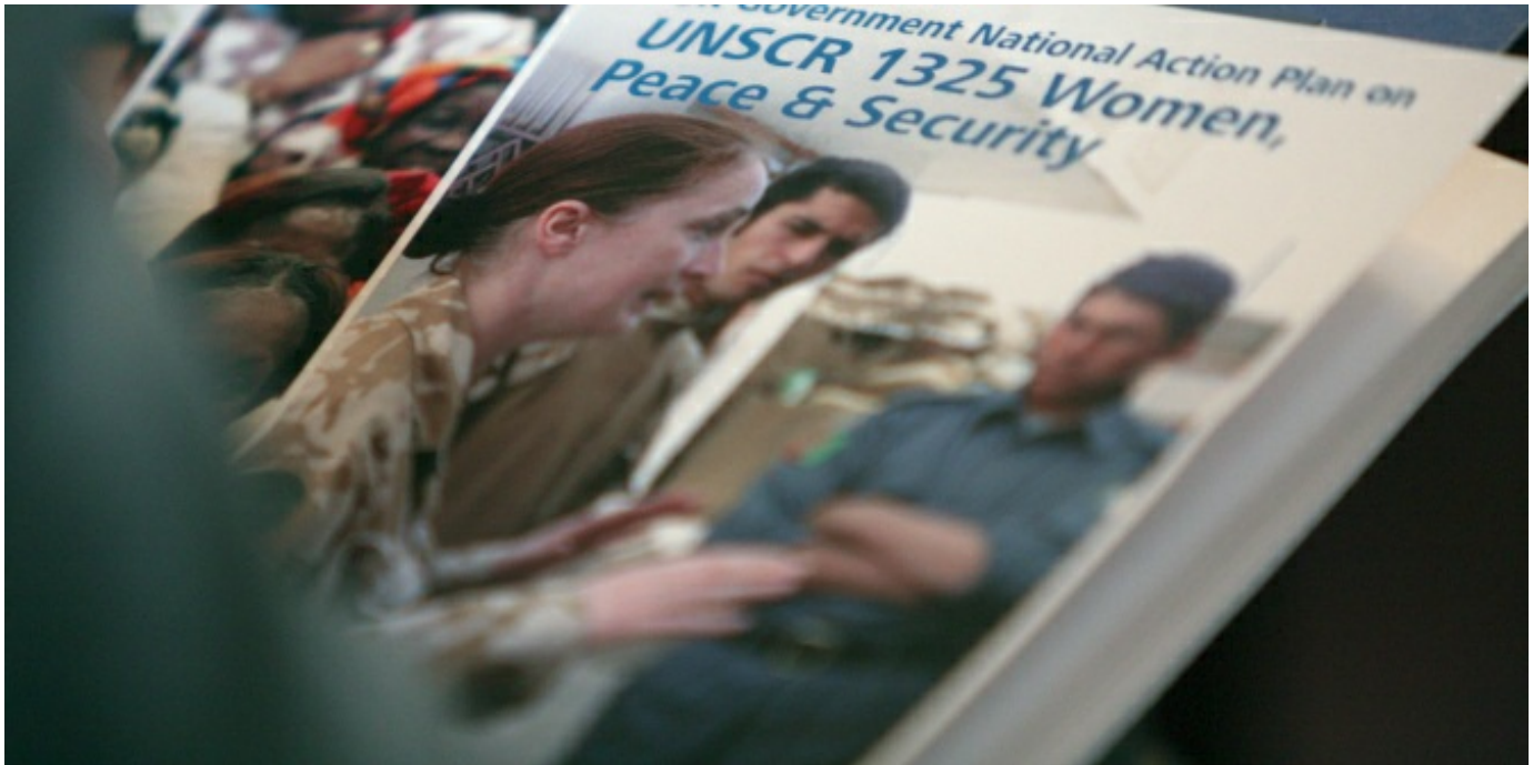
Image Credit: Launch event of the UK Government National Action Plan on United Nations Security Council Resolution 1325 Women, Peace & Security in London, 25 November 2010 (Foreign and Commonwealth Office, OGL)

In Burundi, the Arusha Accords of 2000 included reference to a 30 per cent quota for women's political representation. Anderson's account of women's activism in Burundi in this moment is particularly interesting, considering the interplay of national and international forces that delivered on women's rights. She describes a process by which the United Nations Development Fund for Women (UNIFEM) supported women's activism on the ground, and 'sought to create an example of women's participation in a peace process to use in their campaign for a Security Council resolution on women, peace and security' (76). In both of these positive examples, Anderson argues that it is through the influence of transnational advocacy – either through direct influence in the case of Burundi, or organically through grassroots activists' previous transnational work in the case of Northern Ireland – that international discourse around women and human rights makes it into peace agreements.