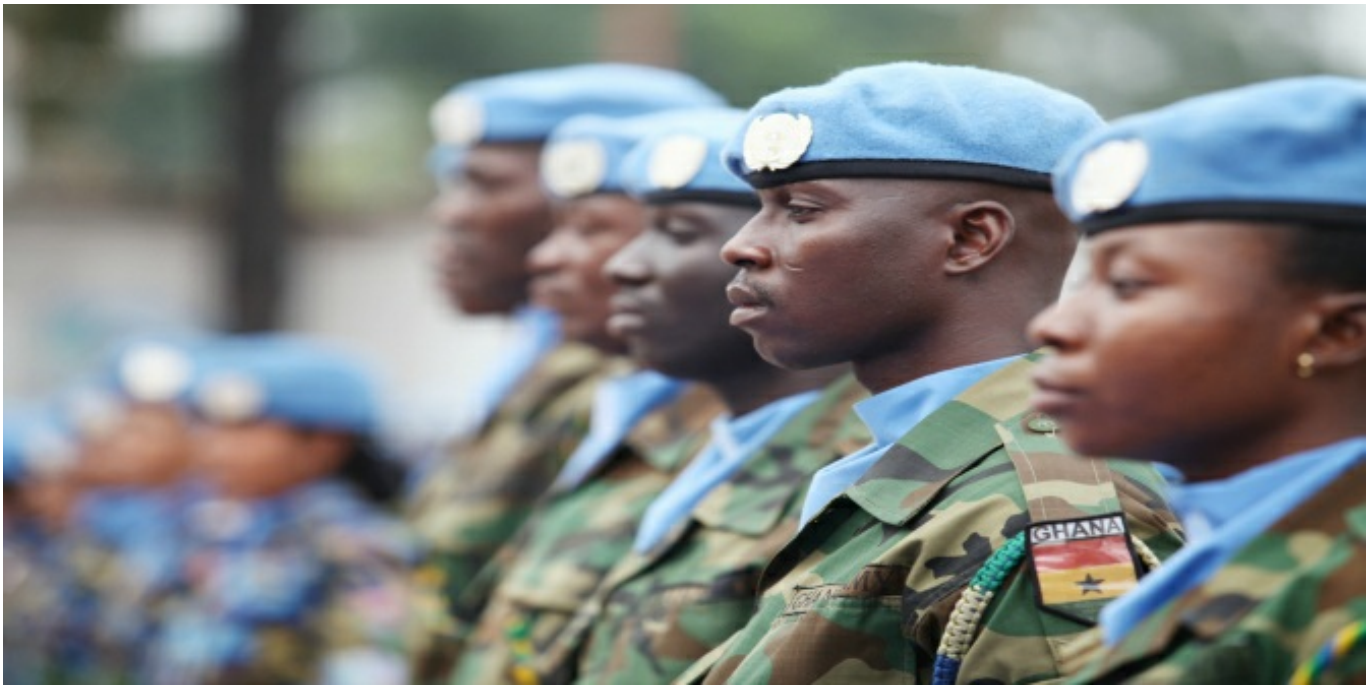
UN Peacekeepers Day 2013 Celebration in the DR Congo