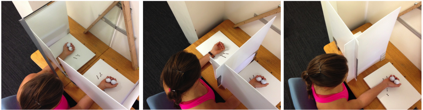
Fig 1. Experimental set up for the visual feedback conditions in the three training groups. Experimental set up for the visual feedback conditions in the three training groups: Mirror Vision (left), Passive Vision (middle), and Active Vision (right).