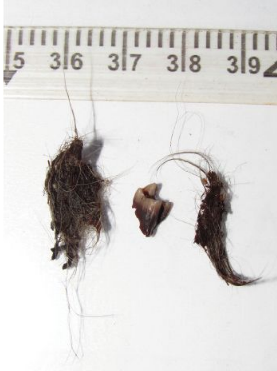
Figure 3. Mammalian (likely blue duiker) remains from chimpanzee faeces collected the day after the observed meat consumption (credit: S. Ramirez-Amaya).