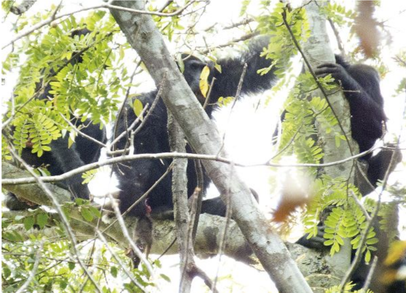
Figure 2. An adult male chimpanzee at Issa holds the blue duiker carcass.

At 0816 h EM and a field assistant encountered a party of at least five individuals who were foraging Julbernardia globliflora fruits in miombo woodland. Researchers followed the party into a riverine forest, with individuals periodically in and out of sight, when they heard a cacophony of chimpanzee vocalizations, including alarm barks. When researchers arrived, they encountered a party of nine chimpanzees and were able to approach within 10 m, although the chimpanzees were obscured in the canopy vegetation. Through a hole in the canopy, they identified an adult male climbing up whilst holding the carcass of a blue duiker in one of his hands (Figure 2). Six other individuals that clustered within 2 m around him followed him. At this time the carcass had already been dismembered, with only a portion remaining with the male in sight. The meat holder fed on and picked at the carcass whilst simultaneously allowing at least one other adult male as well as an adult female and her dependent offspring to feed from the meat by taking some pieces. Selectively, he chased and denied other individuals access to the meat.