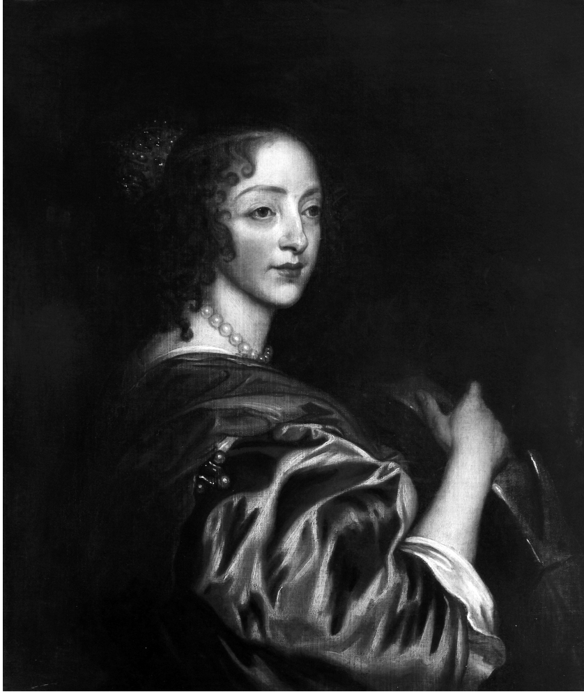
Figure 1. "Queen Henrietta Maria as Saint Catherine" from the studio of Anthony Van Dyck (c.1639).

from Henrietta Maria's elite theatricals, as in the court masque The Temple of Love (1635) by William Davenant and Inigo Jones. Paid for by the queen and performed possibly four times at court, with Henrietta Maria dancing the role of Indamora, The Temple of Love boldly celebrated the queen's success as a Counter-Reformation champion, encapsulating her anticipation of a deeper and permanent revival of the old faith in England. 9 It is little wonder that by the 1640s, Protestant concern regarding Henrietta