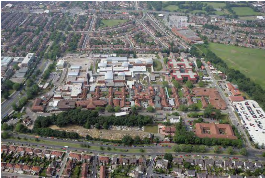
Figure 2 – Broadgreen Hospital