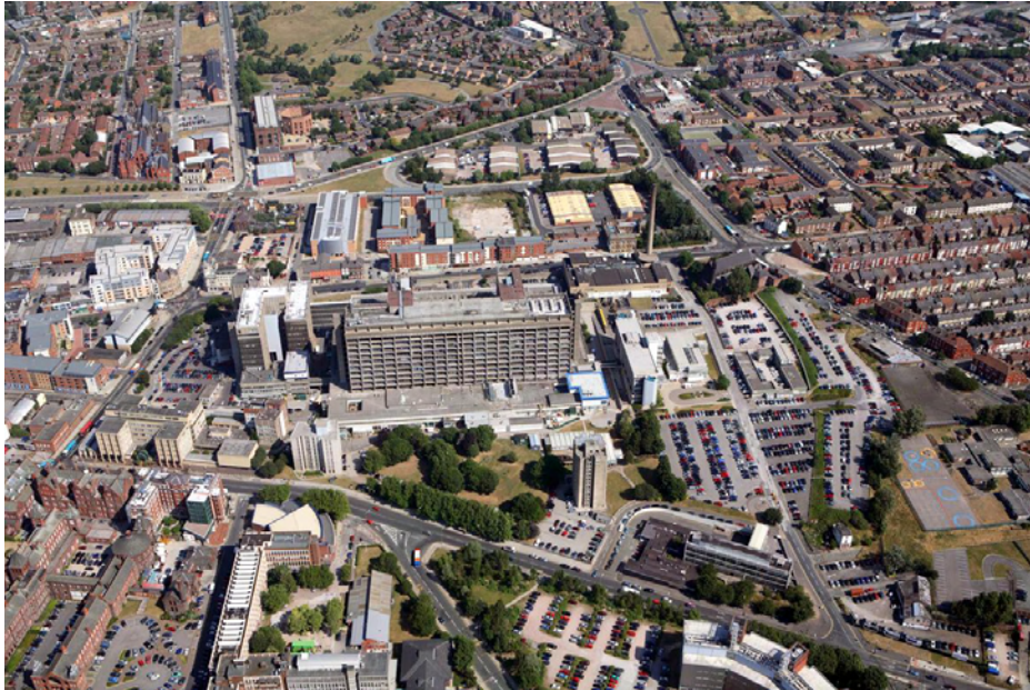
Figure 1 – the Royal Liverpool University Hospital

Broadgreen Hospital, with 192 beds is located within Knotty Ash ward towards the edge of the city close to the M62 motorway, on a site shared with the Cardiothoracic Centre - Liverpool NHS Trust and the Broadoak acute mental health unit of Mersey Care NHS Trust. It has been largely rebuilt within the last 20 years. A new surgical diagnostic and treatment centre for this Trust came into full use in August 2006. A range of elective general, orthopaedic, urological and ENT surgery is based on the site, together with specialist services for older people (including rehabilitation), dermatology and satellite renal dialysis.