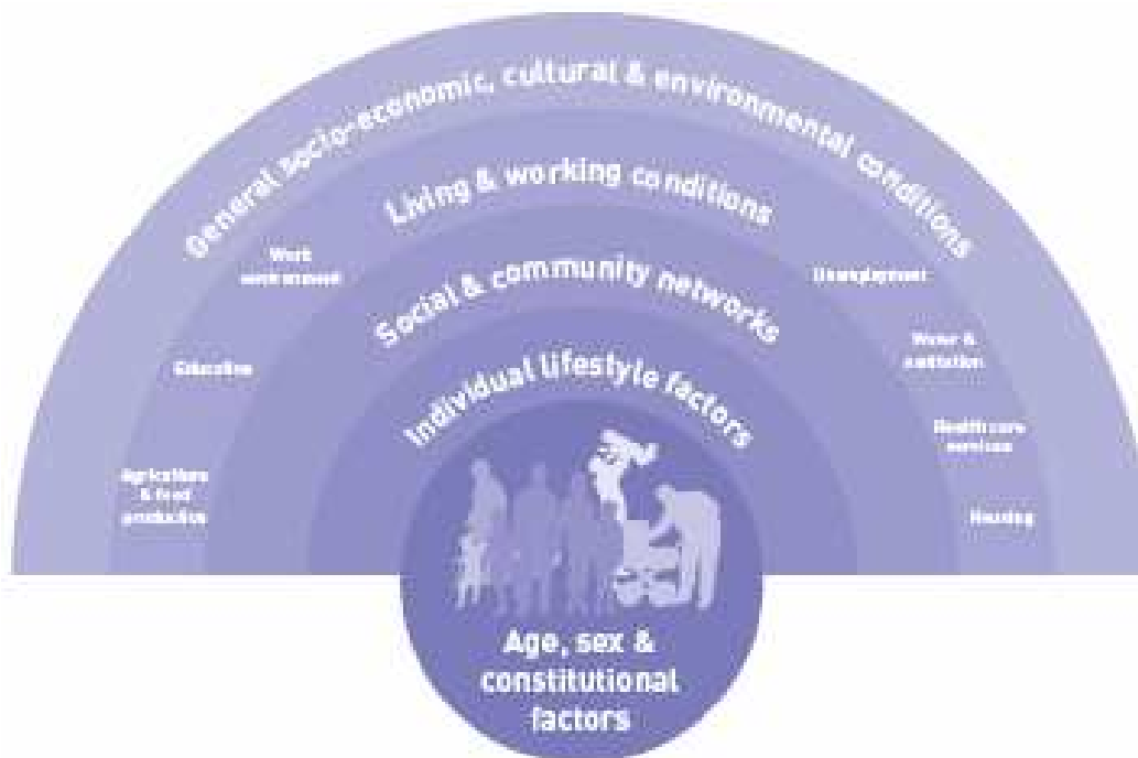
Figure 1: Determinants of Health 2