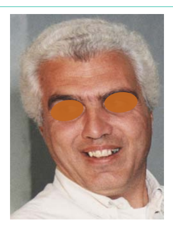
Figure 3: Antemortem photograph of the victim showing the lingual positioning of tooth 12 and the heavily decayed tooth 23.