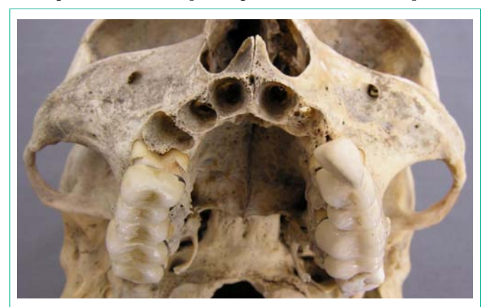
Figure 2: Lingual positioning of the socket of tooth 12 (white arrow) and antemortem loss of tooth 23 (black arrow).

A dental examination was performed at the Forensic Odontology Unit at the University Of Athens Dental School. The police investigation did not yield any antemortem dental records from the suspected victim's general dentist. However, a comparison of the postmortem dental findings with dental evidence on the anterior teeth as they appeared in the victim's photograph provided an acceptable positive identification. Specifically, the dental examination indicated that the socket of tooth 12 was positioned lingually, out of alignment compared to its neighboring teeth (Figure 2). In the antemortem photographs of the suspected victim, it can be observed that tooth 12 is also lingually positioned (Figure 3). In addition, tooth 23 was missing and in the corresponding area there was a fixed prosthesis