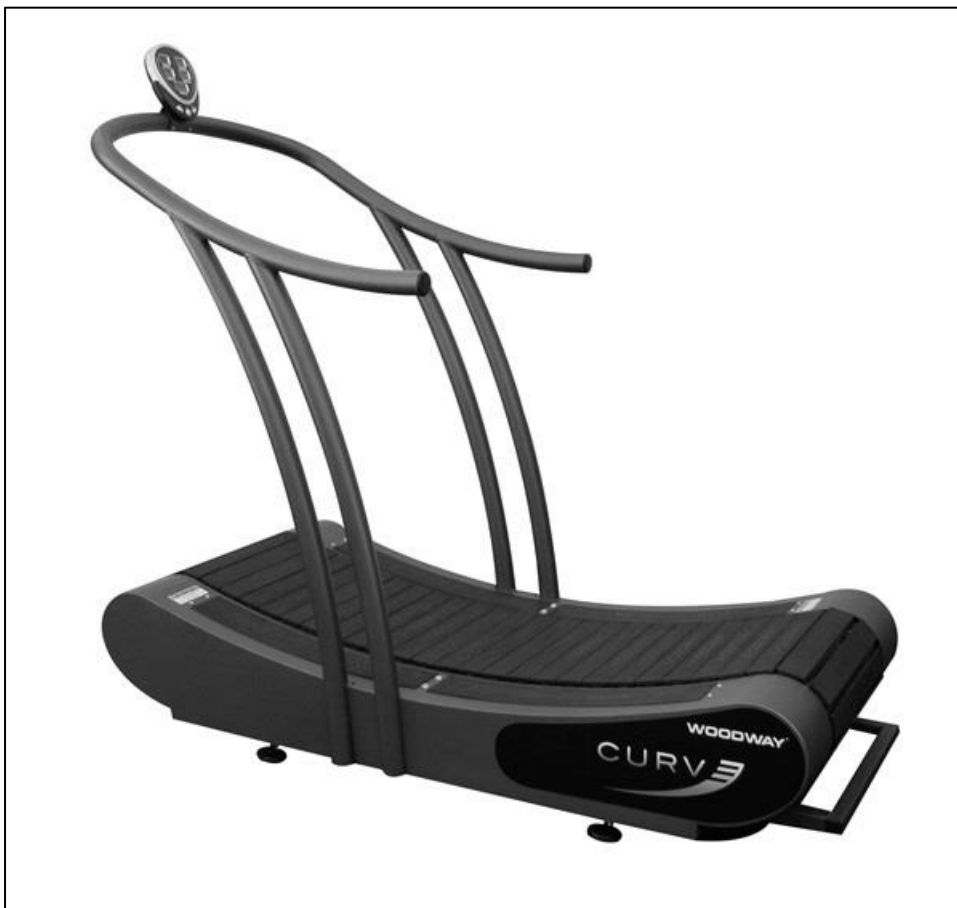
Figure 1: Non-motorized treadmill

A video recording of each sprint was made at 50 Hz, with inset of the treadmill clock to reliably separate left and right steps in the recorded force profiles.