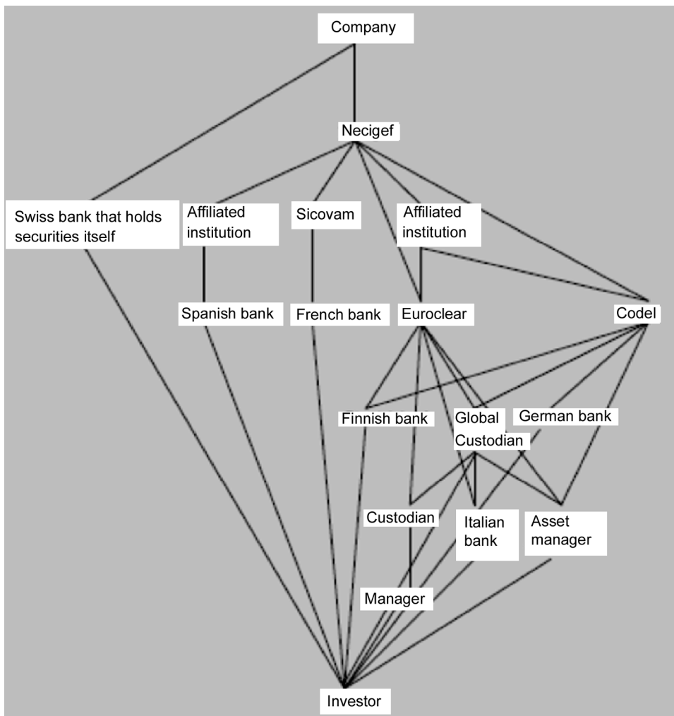
Figure 2 Example of securities ownership in Necigef, a Dutch company

the existing complex voting chain by requiring intermediaries and custodians to offer the options of omnibus client and individual segregated accounts (Computershare Investor Services Plc, 2013). Individual segregated accounts should simplify the voting process and is more transparent. However, it is more expensive since tracking individual accounts and transactions involves more work. The extra cost may be reflected in the price, which is then passed onto the investors. A solution to reduce cost is to have a tiered model of segregation with different prices attached. This will offer flexibility and options to investors.