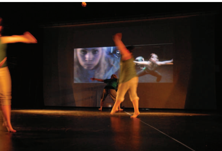
Figure 4. Use of near to and far from the camera.