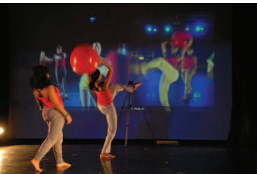
Figure 8. Project 5 Passing the ball across the space.