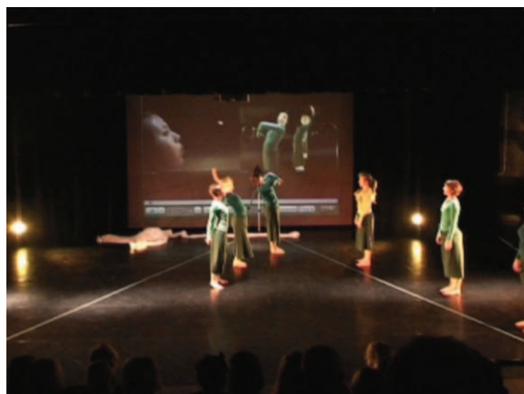
Figure 9. Being blown across the virtual space.