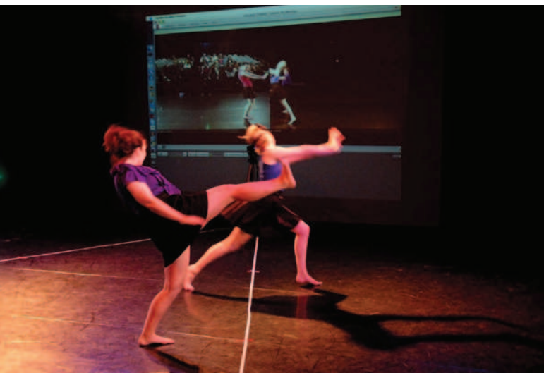
Figure 6. Meeting across the divide.