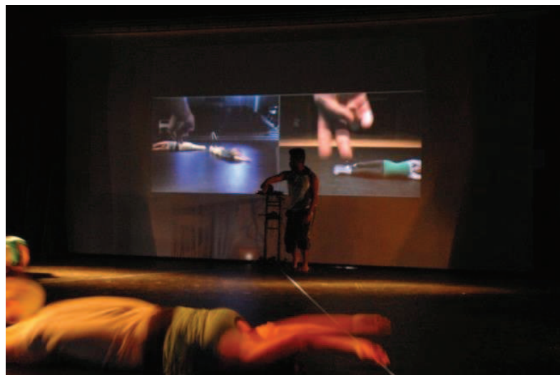
Figure 5. Appearing to manipulate other performers.