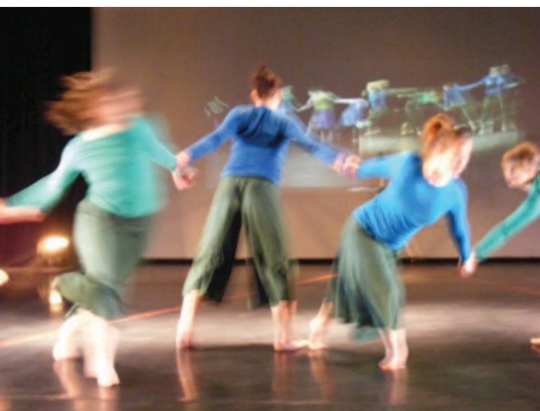
Figure 2. Dancers link hands across the Zone of Virtual Interplay.