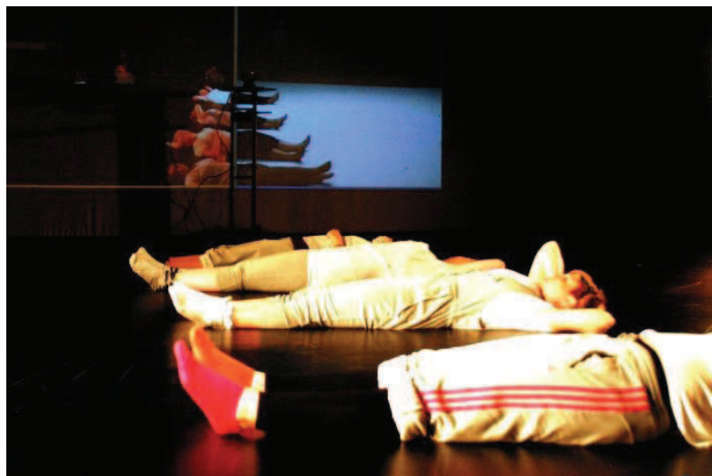
Figure 7. Two halves of the whole.