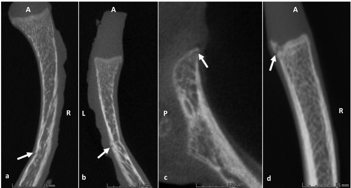
Fig. 3. Transverse sections through further rib injuries examined in this study, indicated by the arrows. (a) Case 2, Anterior right 5th rib, acute fracture identified on micro-CT but not on histology; (b) Case 2, Anterior left 2nd rib, possible fracture identified histologically and confirmed on micro-CT; (c) Case 3, Posterior right 5th rib, possible micro-CT fracture confirmed histologically; (d) Case 2, Anterior 8th rib, fracture identified with both methods but classified as healing (5–14 days prior to death) using histology. R = Right, L = Left, A = Anterior, P = Posterior.

authors of that study emphasise that the results from these methods and the macroscopic examination are an essential prerequisite to direct the histopathologist to the relevant areas, and without them the histopathological process would be “almost impossible” [16].