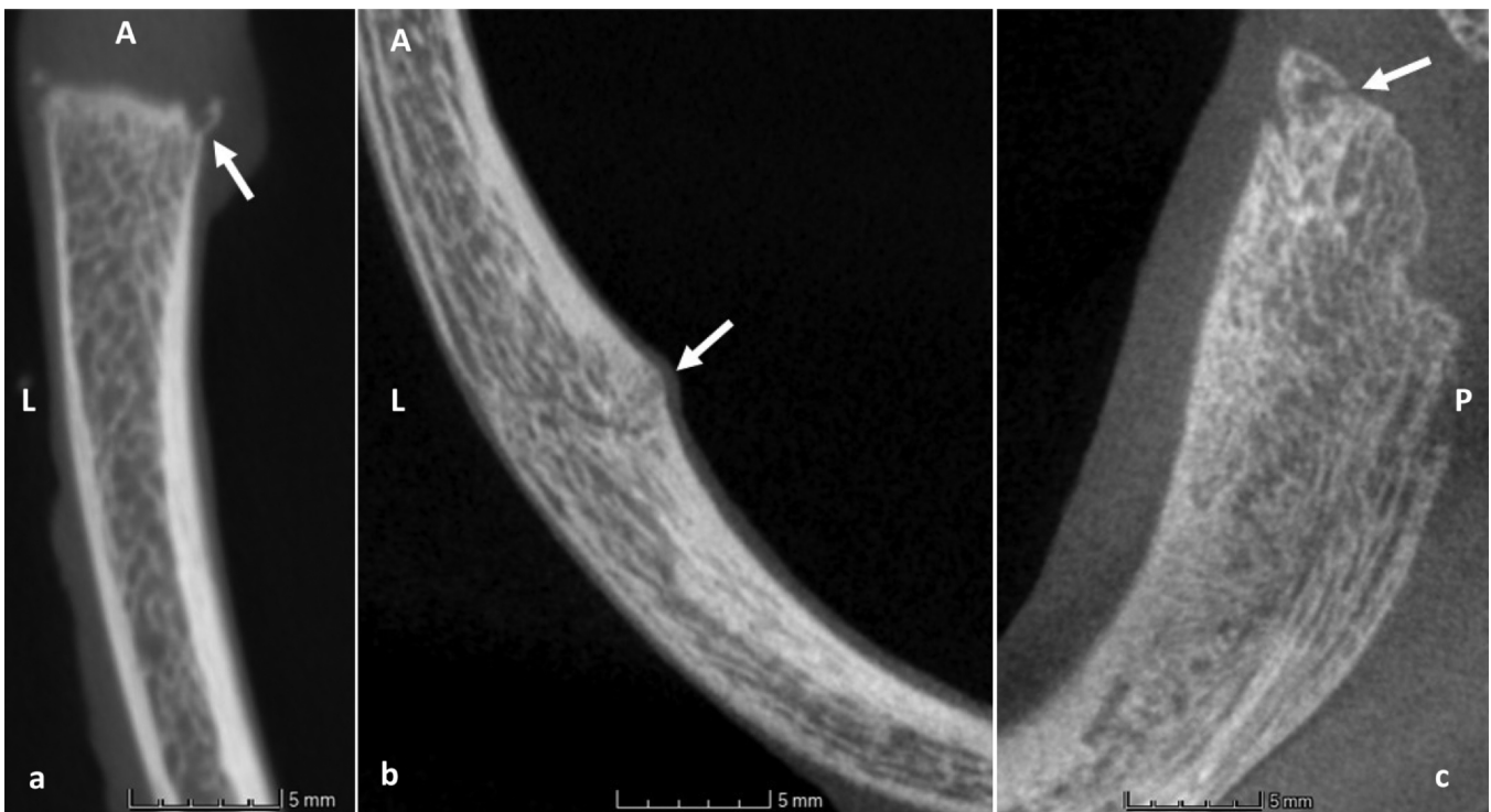
Fig. 2. Transverse sections through some of the injuries encountered in this study, indicated by the arrows. (a) Case 3, Anterior left 10th rib, acute fracture identified by both methods; (b) Case 2, Lateral left 7th rib, healed fracture identified by both methods; (c) Case 1, Posterior 10th rib, healed fracture identified by both methods but acute re-fracture missed on micro-CT. All sections are shown in superior view, anterior is towards the image top. L = Left, A = Anterior, P = Posterior.

sensitivity for determining fracture age using the histological assessment. However, one challenge thereby is that each scan has a slightly different resolution and was performed using slightly different scan parameters (in order to optimise the image quality) which might affect the appearance of the more subtle changes.