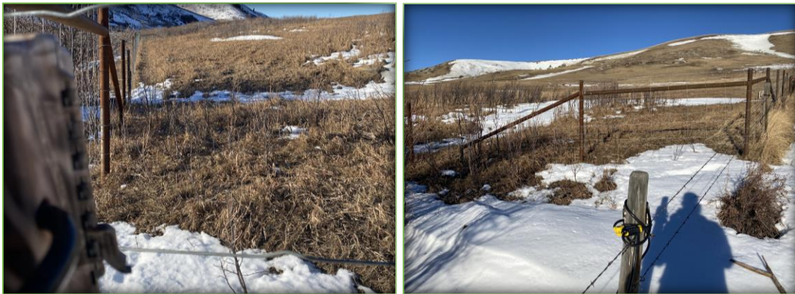
Figures 2a – 2b: The image on the left depicts the closer viewpoint. The image on the right depicts the broader view.

The cameras were left out for a total of two months from the beginning of January 2021 to the beginning of March. Throughout the observational period, there were several periods of frequent snowfall followed by a melt off caused by increased temperatures. Essentially, the purpose was to look at the behaviors elk exhibit as they encounter the fence, i.e., successful or unsuccessful crossing, mode of crossing, behaviors of approach (run up and down the fence line, stop and examine, turn away, etc.) and quantify such interactions similar to that of Burkholder et al. (2018).