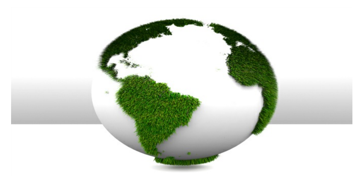
Image Credit: 3D Green Planet Earth (Chris Potter CC BY 2.0 www.ccPixs.com)

In the American tradition, Social Ecology evolved from the micro-perspective of individuals and groups with a focus on how their behaviour and wellbeing depend on interactions with their independent social, built and natural environments. Stokols provides a practical and pragmatic approach to the field when he illustrates the core principles of Social Ecology (65f.): a multitude of interdependent factors must be analysed, and so the objects of study are material and symbolic features, physical and sociocultural components, natural and built elements as well as place-based and virtual domains. Moreover, various temporal and spatial, but also social scales – ranging from individuals and groups to societies and international entities – must be considered. Investigating these complex interactions requires a systemic, multi-level contextual approach: