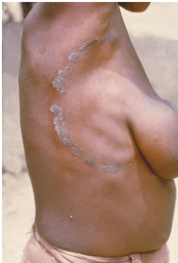
Figure 2. Ringworm on a woman's skin caused by Trichophyton rubrum , a fungus that lives in soil.

Additional research is needed into almost all areas of soils and human health. One of the biggest research needs is an understanding of the complex interactions that take place between chemical species in the soil. For example, Burgess (2013) points out that it is not known whether the mixtures of organic chemicals that end up in soil are creating new, toxic xenobiotics that might be found at very low concentrations but have important health effects on humans and other organisms. Investigation is needed into the ecology and life cycles of human pathogenic soil organisms and the influence of climate change on soils and human health. Less traditional areas that require further investigation are the possible health benefits of contact with healthy soil (Heckman, 2013) and the possible links between organic farming and human health (Carr et al., 2013). In the modern world, the One Health Initiative ( http://www.onehealthinitiative.com/ )