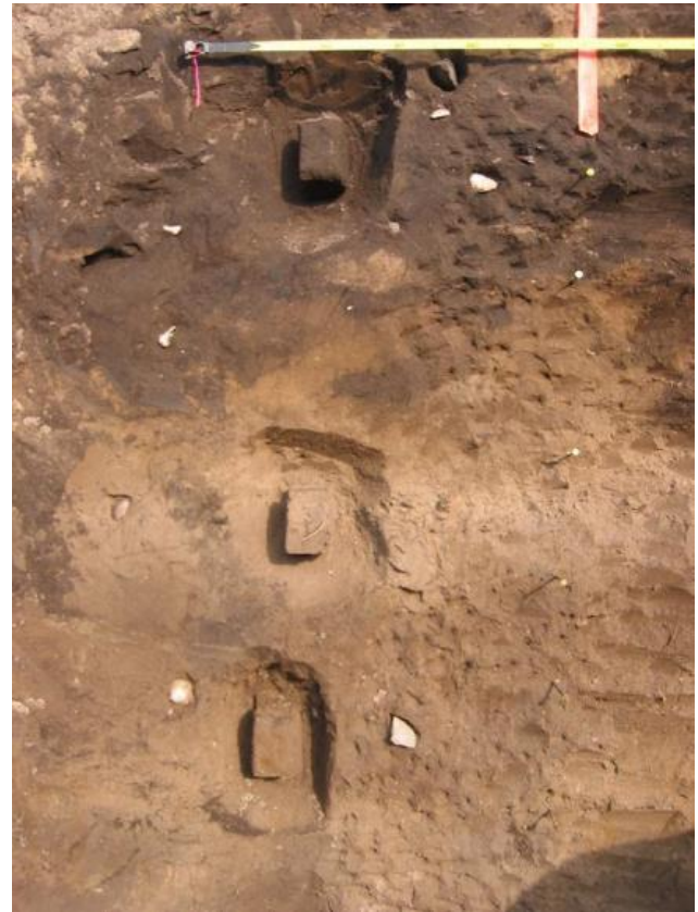
Figure 3. Artifacts within buried soil horizons at an archaeological excavation. The relationship between the soil horizons and artifacts can provide archaeologists with important information. Picture taken near Los Angeles, California, USA, courtesy of Jeffrey Homburg.

When considering the introduction of novel, and possibly more profitable, cropping systems within an agricultural landscape, the availability and distribution of different soils needs to be considered (Yi et al., 2014). Similarly, when new policies are devised to address environmental impacts, soils must be considered (Mérel et al., 2014). In recent years, several studies have linked biophysical and economic model-