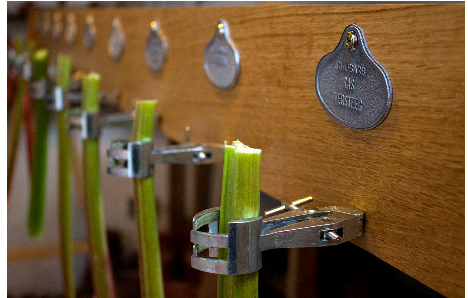
Figure 2. Rhubaphone

The installation has been overwhelmingly popular with gardeners and visitors, variously described as ‘fun’ and ‘innovative’. It has satisfied some aims in terms of encouraging people to notice rhubarb and its particularities. Touch has been especially important in foregrounding the rhubarb. One visitor remarked “It was great fun and it was actually using the raw produce...and incorporating that into technology, which I thought was really interesting.... I thought that was really different because you can actually feel and touch the produce.” Another, when asked to compare to a screen-based alternative said, “I think that (‘Talking Rhubarb’) is a better