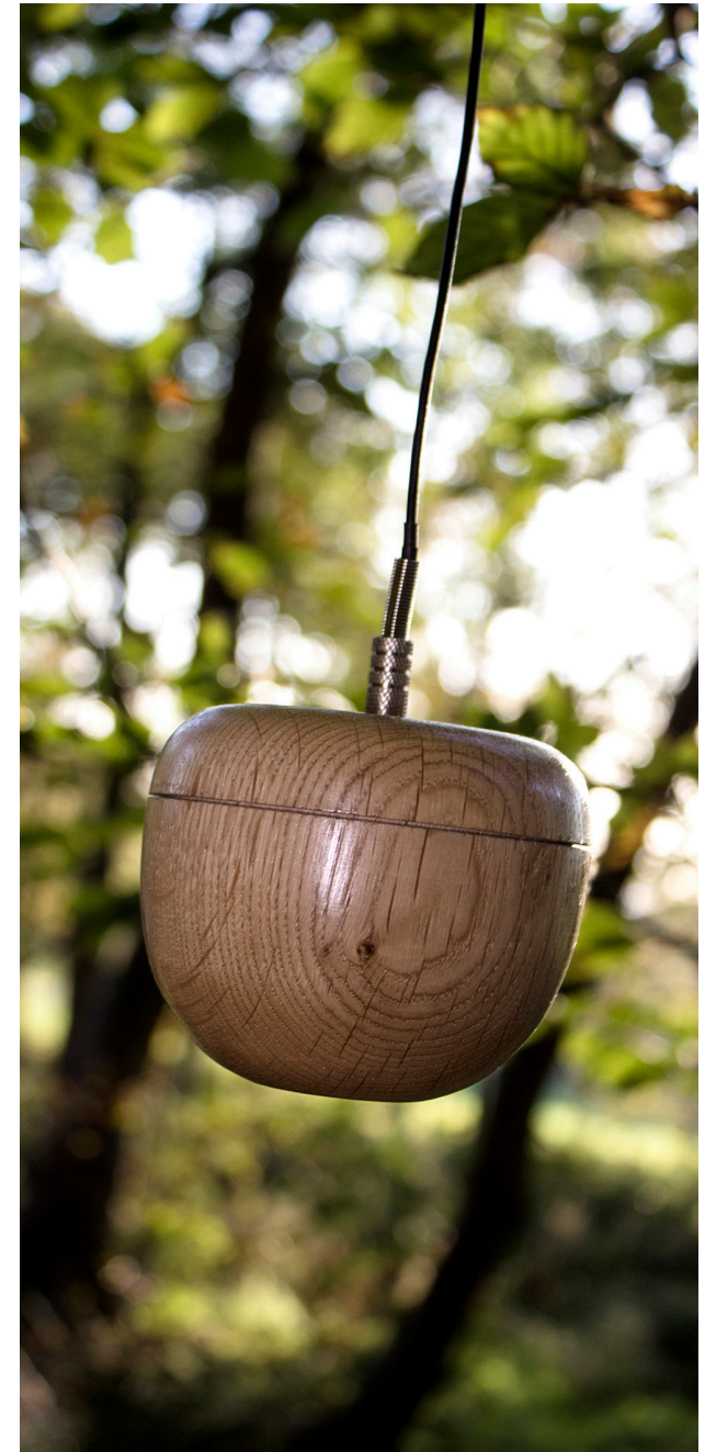
Figure 3. Audio Apple.

It is hoped that bringing forward hidden facets of the garden will cause ‘presencing’ and support the emotional and sensory connections that contribute to place making. At this stage the design raises questions: Do the audio apples get in the way of experiencing the garden directly?