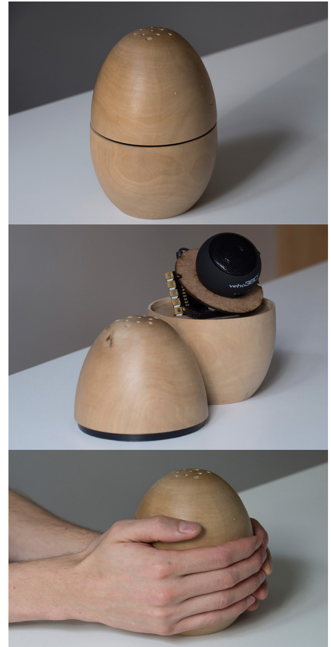
Figure 1. Meditation Egg.

We made the egg from wood because of its sensory qualities; the way it warms in the hand, its smell, texture and weight, and (if partly seasoned), the way it ‘lives’ and changes over time. Its resonant qualities are also attractive. The shape is designed to fit well in hands. Critically wood is a poor conductor of electricity and focus is needed to hold the object so that a capacitive connection can be made with the metal contacts