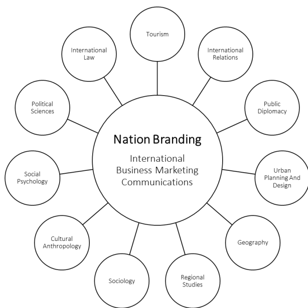
Figure 2: Disciplines related to place (nation) branding

The various disciplines related to place/nation brand and place branding are shown in Figure 2 below.