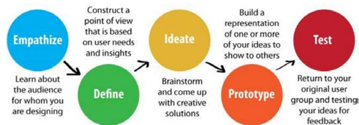
Fig. 1. The 5-step Design Thinking Process (adapted from [3])

After careful consideration of the available Design Thinking frameworks, we chose Stanford's d.school 5-step model [3] as it contains and further granularizes other frameworks well. This is in line with Lugmayr et al's approach to teaching media students at a Finnish university [14]. Figure 1 illustrates the 5 key steps: