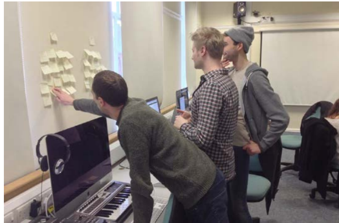
Fig. 2. Ideation: Sorting and selecting ideas written on Post-it notes