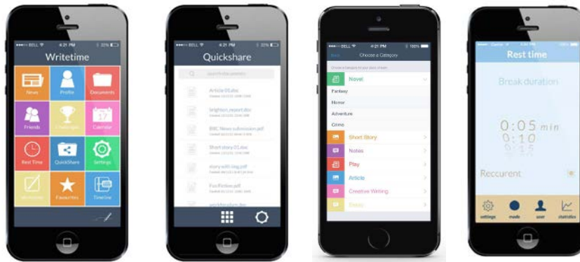
Fig. 4. Selection of app interface designs – see video for full UX

We would like to reiterate that the app was not actually developed. Testing was based on designs and user experience only, therefore no data about the efficacy of the behavior change intervention is available. This is not considered a weakness of the research, as the focus was on students' engagement with the Design Thinking process.