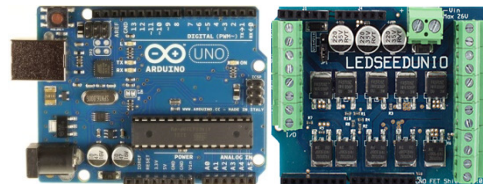
Fig 3. Arduino microcontroller and MOSFET driver