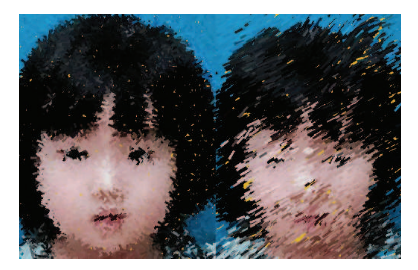
Fig. 2. Left: the original image is segmented into many line stroke segments. Right: these line strokes are animated using the boid framework.