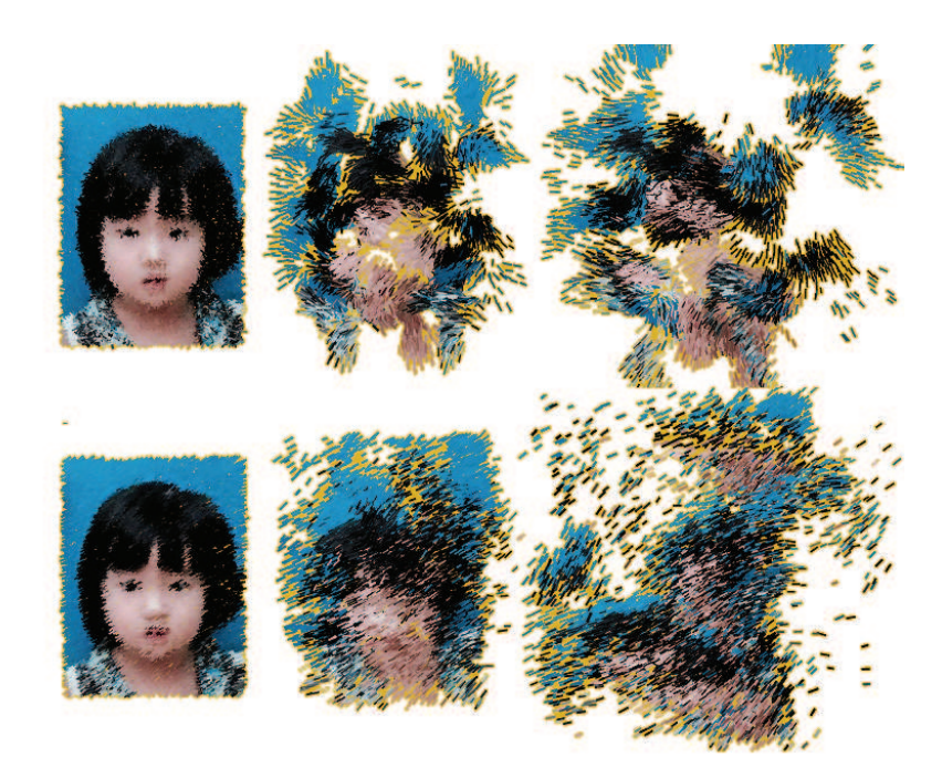
Fig. 4. Snap shots of animation frames, from topleft and in a clockwise direction: (i) original image, (ii, iii, iv, v) the swarm of cubes is simulated, and (vi) the swarm integrate back to form the original image.

We simulated two swarm appearances: swarm of mosaics and swarm of line strokes (see https://www.youtube.com/watch?v=a-V6h0VzTZ8). Figure 3 shows 10 snapshots (5 from each example) of a swarm of mosaics. The exercise in this figure was motivated by the idea to create a swarm movement of mosaics. An original image disintegrated into a swarm of cubes, traversing in a 3D space before integrating back to its original position. We arbitrarily set the width of each cube at 7 pixels as we felt that this produced an appealing swarm movement.