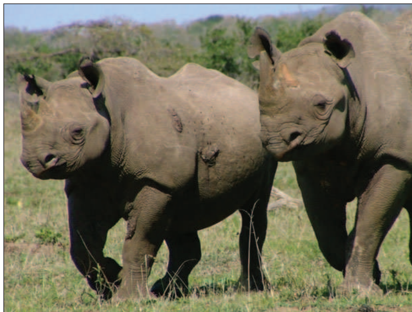
Figure 2. Black rhinoceros ( Diceros bicornis ) populations have benefited greatly from metapopulation management through translocation. Excellent record-keeping by government biologists and private partners has enabled the resulting data to be analyzed and applied for management.