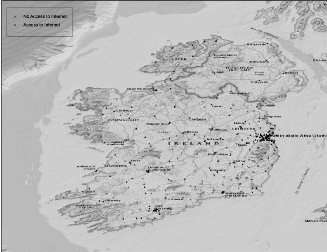
Figure 1. Geographical distribution of Broadband Coverage.