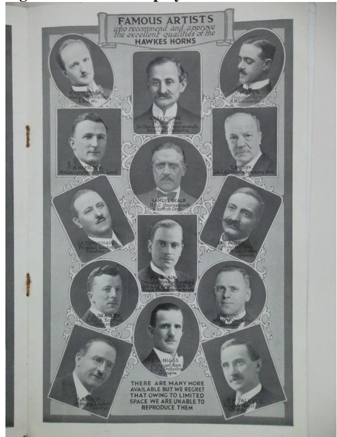
Figure 2 British horn players of the 1920s