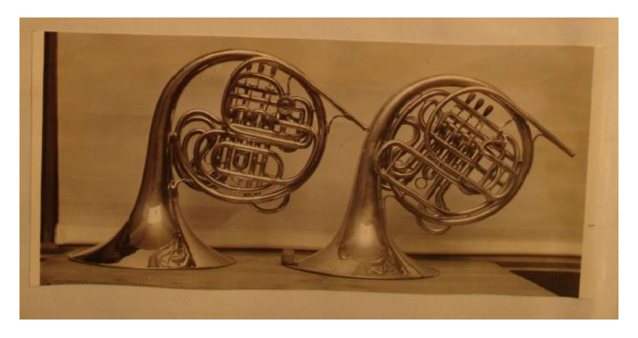
Figure 3 Boosey & Hawkes German horn circa 1935 (horn on the left)