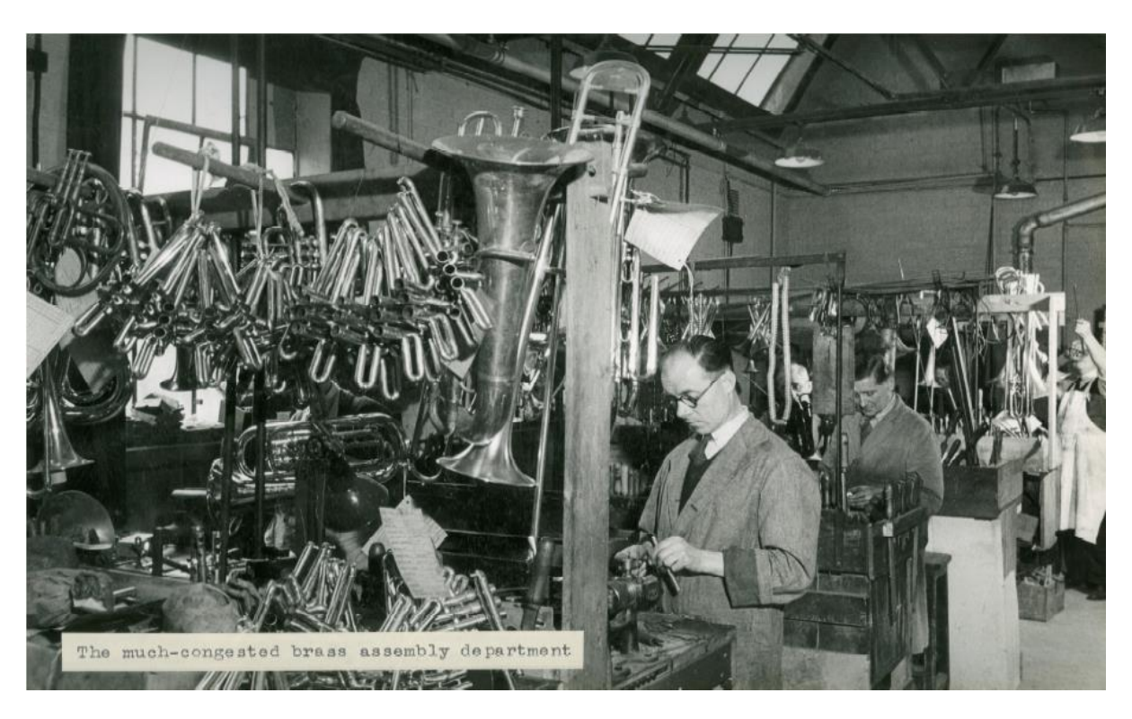
Figure 4 Boosey & Hawkes brass instrument production during World War Two