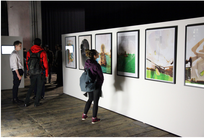
A New Peninsula drawings at the Silver Linings exhibition