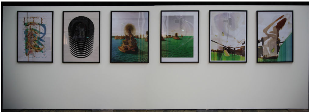
Above: A New Peninsula work in exhibition Below: Panorama of Silver Linings exhibition