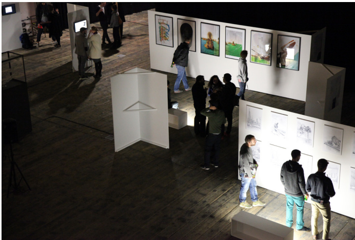
Left: Exhibition Private View