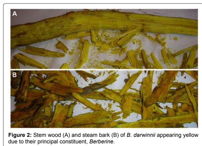
Figure 2: Stem wood (A) and stem bark (B) of B. darwinii appearing yellow due to their principal constituent, Berberine .