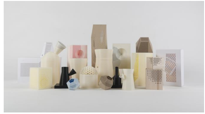
Figure 1: Multiple iterations of the enclosure of the Energy Babble.

Developing the material characteristics on the device required explorations along various lines, from functional and pragmatic requirements to the technical demands of the hardware contained enclosed within the form. Overall however, was the deep investigation of the aesthetic qualities of the object that had to embody all of these concerns as well as the key research agenda and questions.