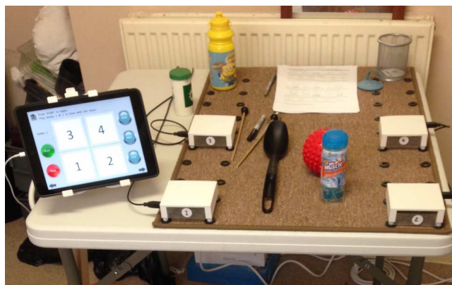
Figure 1: The study setup where P3 could sit at a table and perform active forward reaching activities using 4 bespoke digital drum pads synced wirelessly to an iPad App

DOI: http://dx.doi.org/10.1145/2858036.2858376