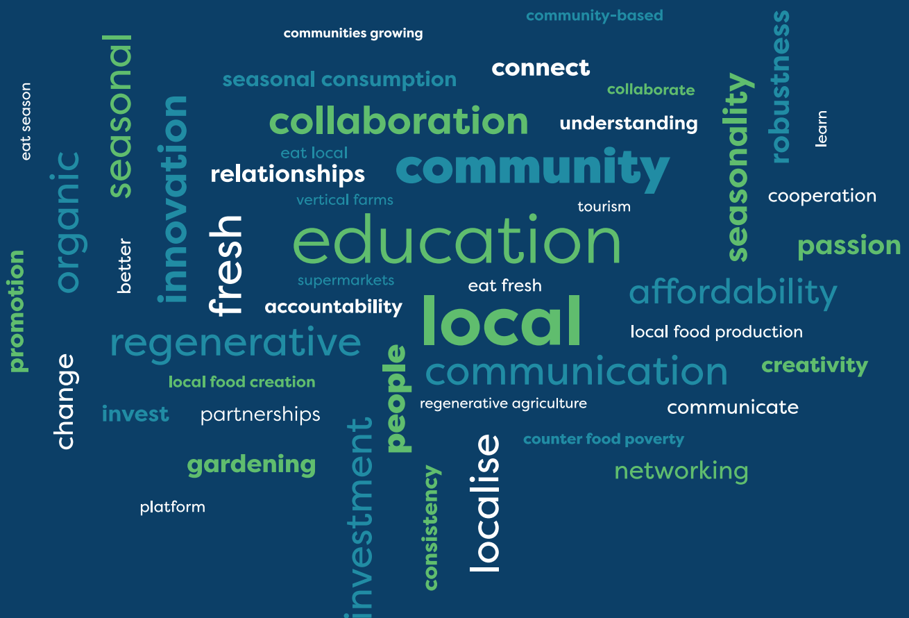
Figure 2: Participants' Word Cloud communicating their interpretation of 'sustainable development'

a more resilient and sustainable food economy?'. The resulting word cloud illustrated the collective sense of the importance of education , community , collaboration and local as central tenets, as illustrated below.