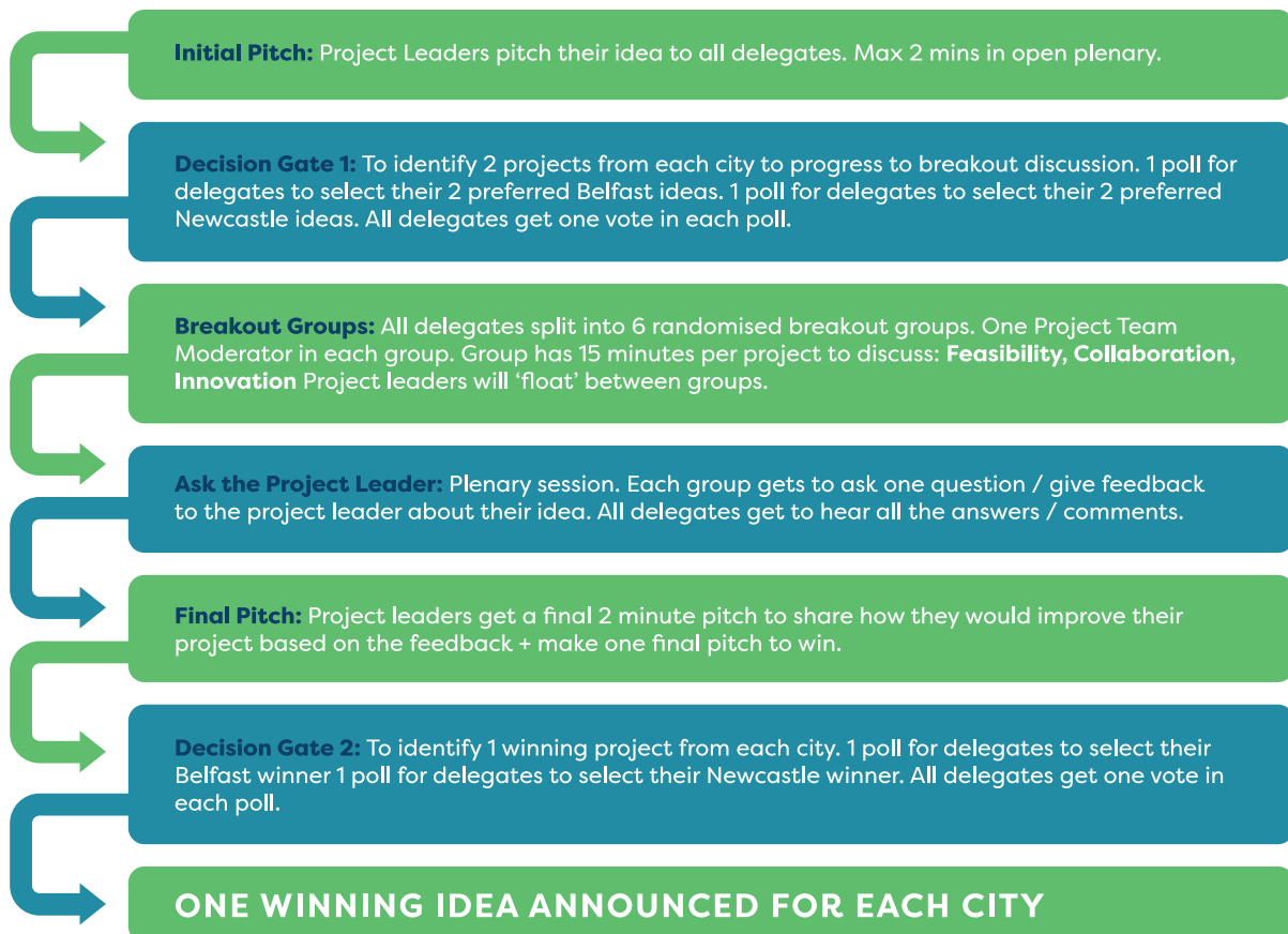
Figure 1: Workshop 2 Procedure for shortlisting project proposals

As an outcome of the workshops, delegates were asked to agree and vote on two priority projects, one from Belfast and one from Newcastle, that will strengthen the sustainability and resilience of the local food economy. Each project received seed-funding worth £1,500 to support the kick-start, implementation and progression of their project. Each project leader was encouraged to stay