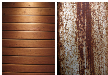
Figure 2. Two textures from ANGELINA-5 's repository of over 600.

Once ANGELINA-5 has a theme word it attempts to expand the theme using word association databases 4 . We plan to replace this technique with a more relevant topic association approach in future, but for most applications word association provides a reasonable set