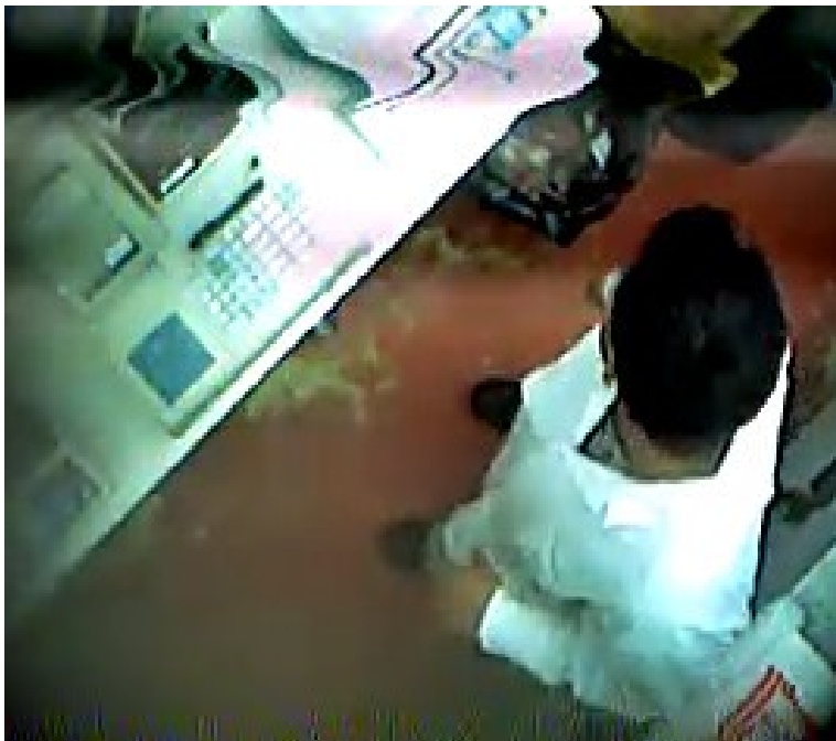
Fig. 4 Worker and till in halal butcher's, Deptford.