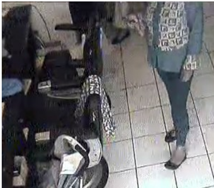
Fig. 5 Hairdresser's, Deptford.

normative novel of gentrification as a cultural process 'lifting everybody up' (Allen, cited).