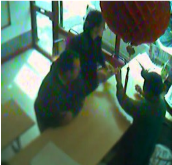
Fig. 10 Participant enters a Chinese take-away and asks for menu, Deptford.