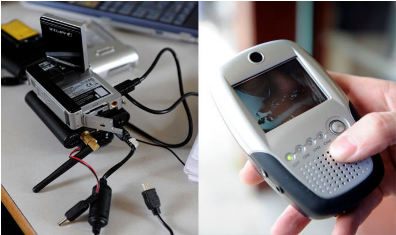
Fig. 1 Recording and sniffing devices (Deptford.TV).

Deptford.TV is an open and collaborative platform for media artists and network activists, conceived by dr. Adnan Hadzi (Dept. of Media, Goldsmiths). Since 2005 Deptford.TV has been experimenting with art and media methods in order to increase participation and sharing of research practices. With the Centre for Urban and Community Research, it launched a series of practice-based workshops on collaborative filming and CCTV 'sniffing' with the aim 'to store, share and re-edit the documentation of the urban change of South East London'. 4 Participants, equipped with digital video receivers, cached surveillance camera signals from public and private spaces which were previously invisible (Fig. 1). Following the uncertain signals and the glitches from the electronic waves captured by the device, they were led through inner city Deptford. Some of the questions that workshop participants asked were: What