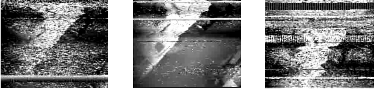
Fig. 7-9 from 'A Trail of Images' (Hadzi et al. 2009).

Nor it is the case that CCTV filming practice might have given room to eccentric and distant, flâneur-like exploration of the city. Despite the recording device could pick up signals many metres away from its source, it was in fact participants' intention to interact with the cameras and make their presence visible in the new spaces discovered by the sniffing practice. In order to do that, they often had to encounter people from 'behind' the surveillance cameras, sometimes being curious shop assistants or suspicious property owners. When such encounters materialised, it was necessary to give explanations on the aims of the project. For De Certeau, encounters form a sort of contract between the walker and other people. Walking is a bit like 'spaces of enunciation' which imply a referent, somebody to talk to. Encounters can become the unplanned and generative way of making space and producing 'fieldwork' (de Certeau 1984, pp.97–99).