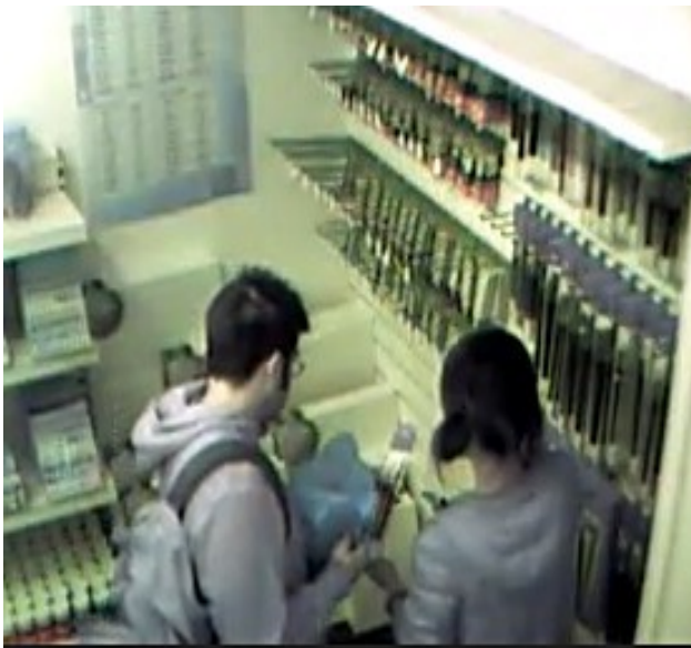
Fig. 11 Participant enters an art shop and asks for paint brush, Greenwich.