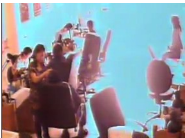
Fig. 6 Nail shop and parlour, Deptford.