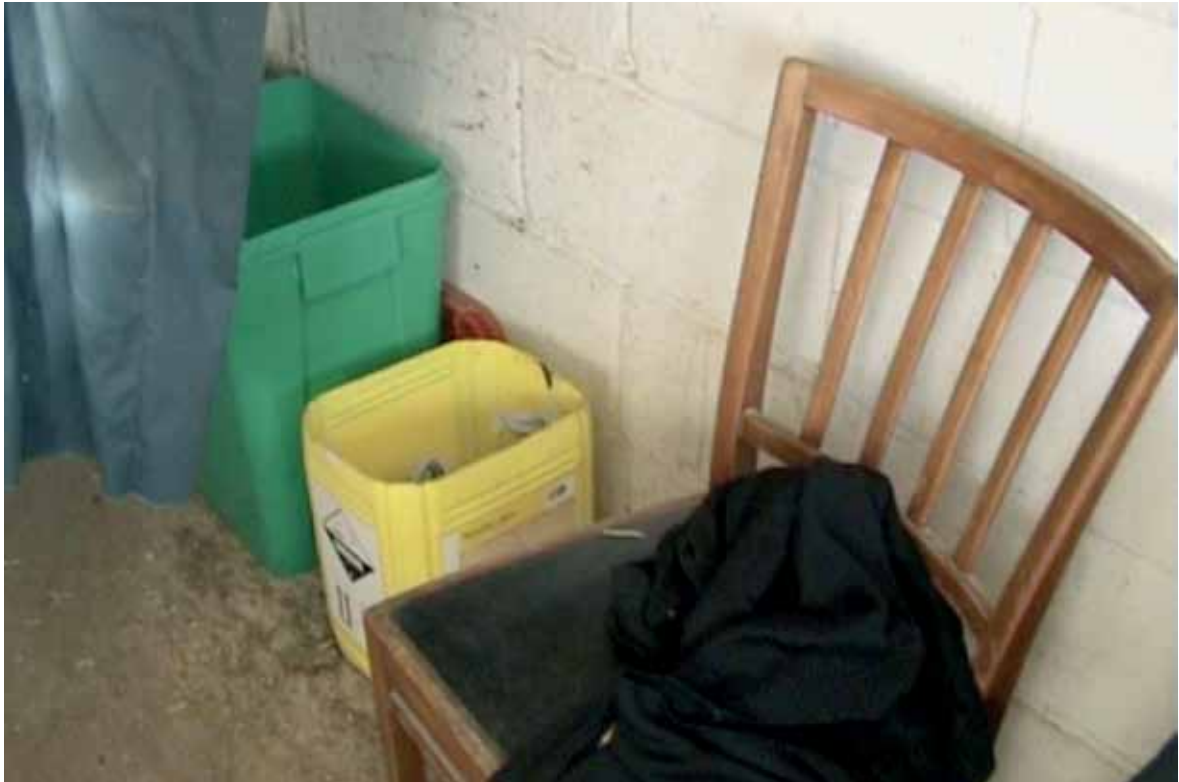
Video still: In the office most of the available floor space is taken up with bins, large cardboard cartons of supplies awaiting unpacking, and three ancient wooden dining chairs whose creaking rails are festooned with jackets, fleeces, and other warm outdoor wear.