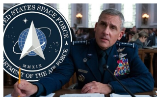
(https://mainecampus.com/2020/12/space-force-spins-a-comedic-tone-on-the-us-political-climate-as-we-approach-a-new-era/) 'SPACE FORCE' SPINS A COMEDIC TONE ON THE U.S. POLITICAL CLIMATE AS WE APPROACH A NEW ERA (HTTPS://MAINECAMPUS.COM/2020/12/SPACE-FORCE-SPINS-A-COMEDIC-TONE-ON-THE-US-POLITICAL-CLIMATE-AS-WE-APPROACH-NEW-ERA/)

Graphic by Antyna Gould. (https://mainecampus.com/2020/12/spotify-wrapped-2020-the-maine-campus-top-tracks/) SPOTIFY WRAPPED 2020: THE MAINE CAMPUS TOP TRACKS (HTTPS://MAINECAMPUS.COM/2020/12/SPOTIFY-WRAPPED-2020-THE-MAINE-CAMPUS-TOPTRACKS/)