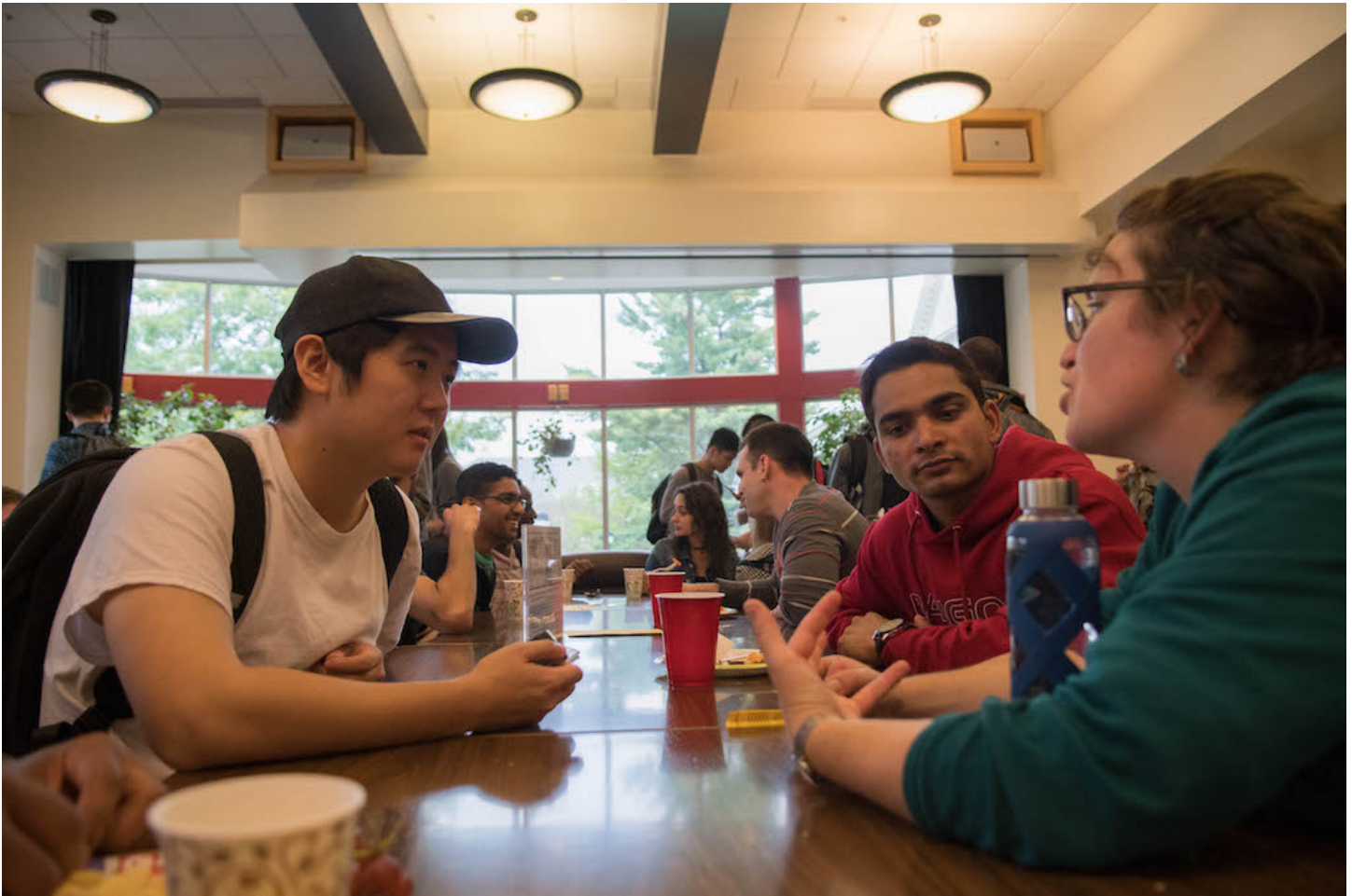
Every Friday at 4 p.m. the International Student Association hosts a Coffee Hour in North Pod, Memorial Union.

Home (https://mainecampus.com) / Culture (https://mainecampus.com/category/culture/) / Campus & Community (https://mainecampus.com/category/culture/campus-community/) / International Coffee Hour helps spreading culture across campus