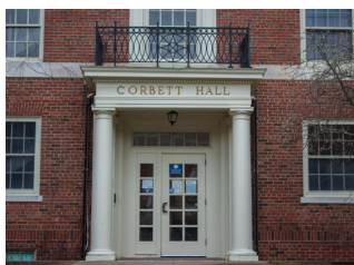
Photo by Antyna Gould https://mainecampus.com/2020/12/anonymous-gift-given-to-the-wabanaki-center-will-fund-wabanaki-student-higher-education/

ANONYMOUS GIFT GIVEN TO THE... (HTTPS://MAINECAMPUS.COM/2020/12/ANONYMOUS-GIFT-GIVEN-TO-THE-WABANAKI-CENTER-WILL-FUND-WABANAKI-STUDENT-HIGHER-EDUCATION/)