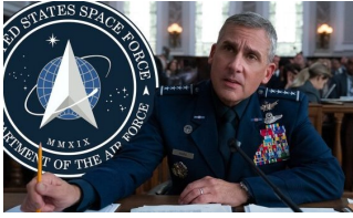
Photo via metro.co.uk. (https://mainecampus.com/2020/12/space-force-spins-a-comedic-tone-on-the-uf-5-political-climate-as-we-approach-a-new-era/)

'SPACE FORCE' SPINS A COMEDIC... (HTTPS://MAINECAMPUS.COM/2020/12/SPACE-FORCE-SPINS-A-COMEDIC-TONE-ON-THE-UF-5-POLITICAL-CLIMATE-AS-WE-APPROACH-A-NEW-ERA/)