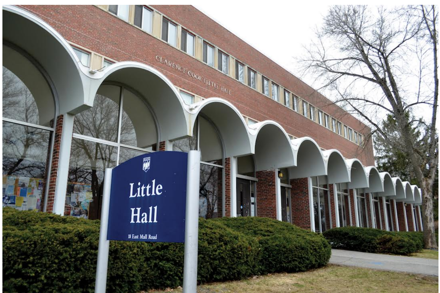
A view of the front of the Clarence Cook Little Hall at the University of Maine (4/19/18).

Home (https://mainecampus.com/ / News (https://mainecampus.com/category/news/) / Campus & Community News (https://mainecampus.com/category/news/campuscommunity-news/) / A little hall with a big, complicated history