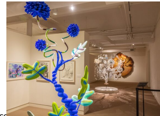
(https://mainecampus.com/2020/12/zillman-art-museum-hosts-creative-conversations-a-qa-with-artist-joanne-carson/) ZILLMAN ART MUSEUM HOSTS "CREATIVE CONVERSATIONS-A-QA-WITH-ARTIST-JC CARSON/) (HTTPS://MAINECAMPUS.COM/2020/12/ZILLMAN-ART-MUSEUM-HOSTS-CREATIVE-CONVERSATIONS-A-QA-WITH-ARTIST-JC-CARSON/)