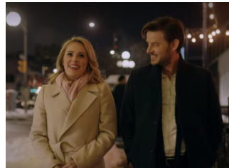
Photo via pluggedin.com. (https://mainecampus.com/2020/12/radio-show-hosts-find-unexpected-love-in-warm-holiday-film/)