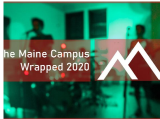
Graphic by Antyna Gould. (https://mainecampus.com/2020/12/spotify-wrapped-2020-the-maine-campus-top-tracks/)