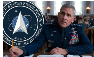
(https://mainecampus.com/2020/12/space-force-spins-a-comedic-tone-on-the-u-s-political-climate-as-we-approach-a-new-era/) 'SPACE FORCE' SPINS A COMEDIC... (HTTPS://MAINECAMPUS.COM/2020/12/SPACE-FORCE-SPINS-A-COMEDIC-TONE-ON-THE-U-S-POLITICAL-CLIMATE-AS-WE-APPROACH-A-NEW-ERA/)