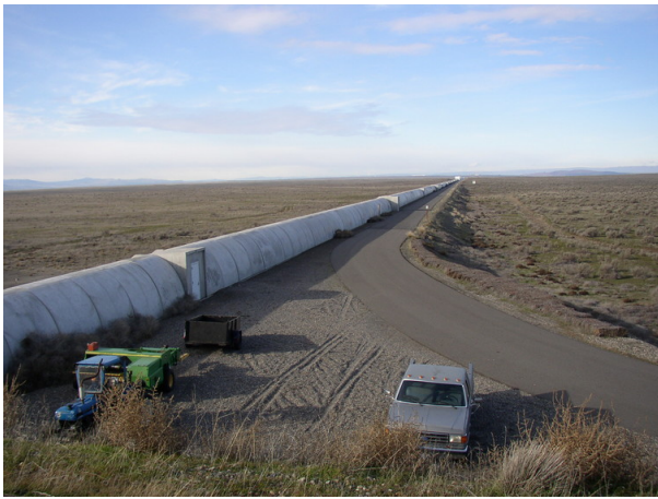
Northern leg of LIGO interferometer in Washington, US.