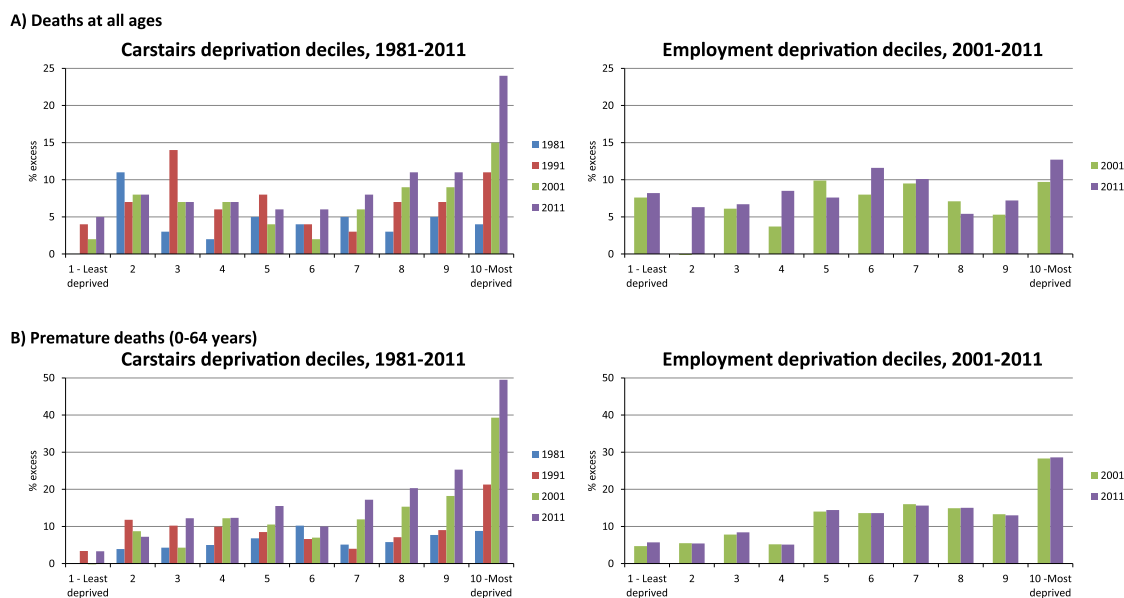
Fig. 2. Scottish excess mortality (expressed as a percentage) by (a) Carstairs deprivation decile (based on English census wards and Scottish postcode sectors), 1981–2011, and (b) Employment deprivation decile (based on English LSOAs and Scottish merged datazones) 2001–2011. Note different scale of x axis between charts in (a) and (b).

periods; in 2011 the excess was 54%, approximately half the equivalent figure for 2001, but comparable to the 1991 level.