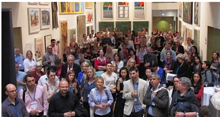
At the conference reception, Ashmolean Museum, Oxford

“Thoroughly enjoyable and worthwhile scientifically.”