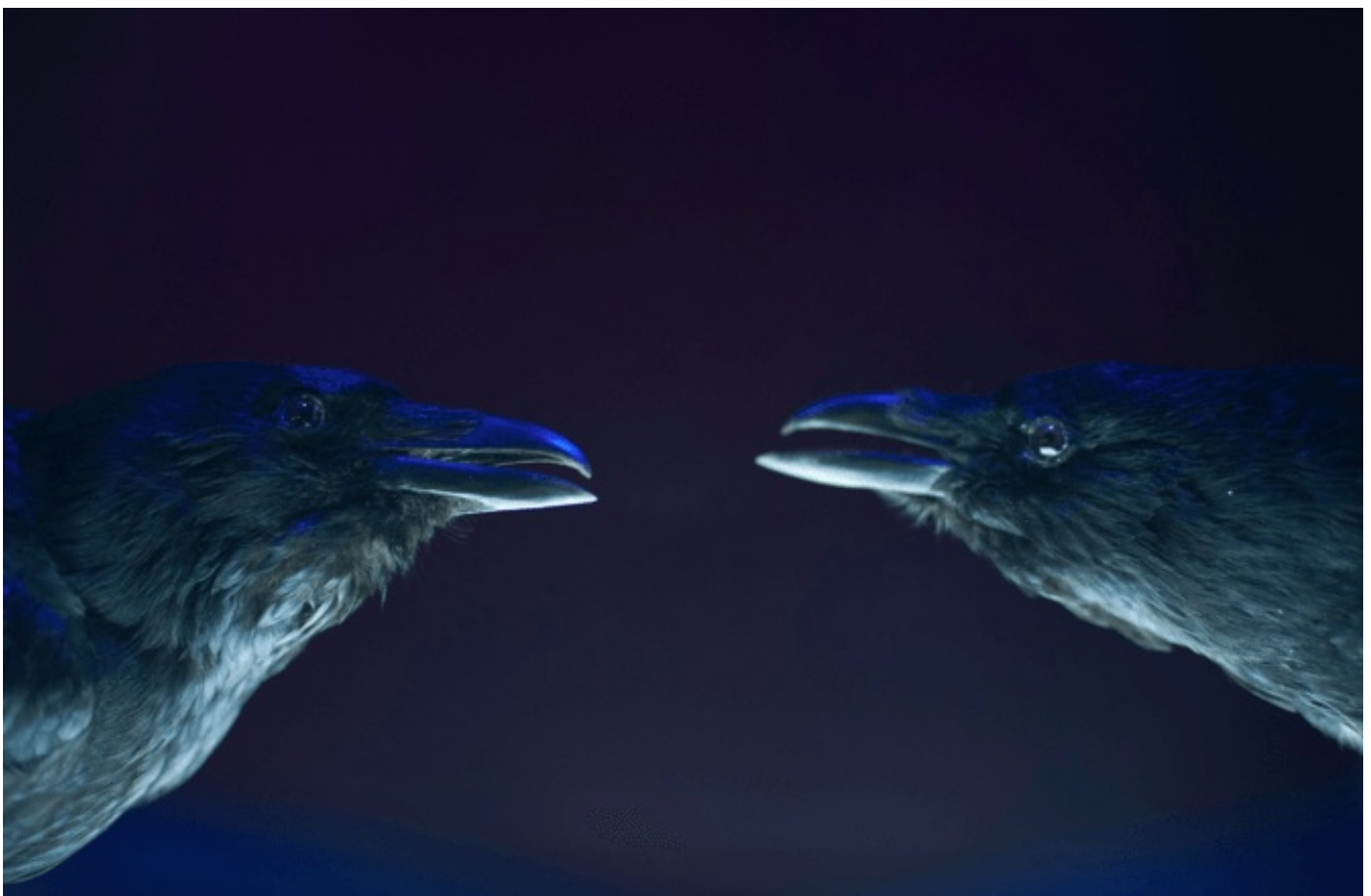
What is really going on? Untitled Projects