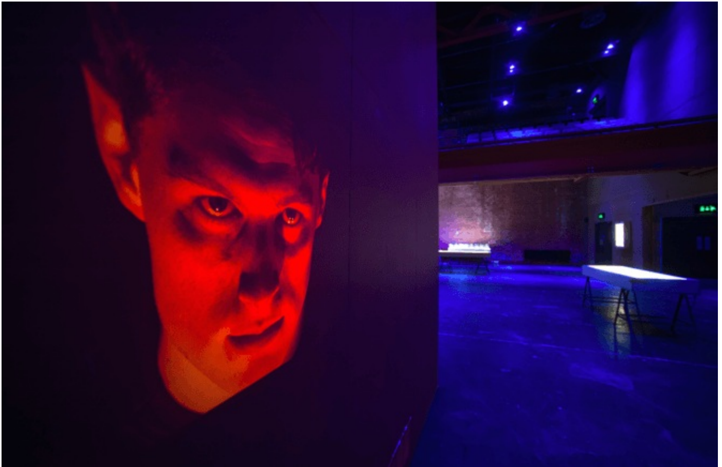
The Devil infiltrates the righteous – or does he? Untitled Projects