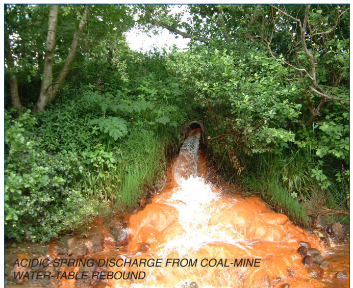
ACIDIC SPRING DISCHARGE FROM COAL-MINE WATER-TABLE REBOUND

In some regions major open-cast or subsurface coal mining continues to supply thermal power plants. In many cases this involves large-scale groundwater dewatering to facilitate safe mining, and this modifies the regional flow system and reduces resource availability for other users. Such activity is best planned using detailed hydrogeological knowledge, which will also be required to manage water-table rebound following mine closure. If this is not managed and treated appropriately, it is likely that unpredictable highly acidic spring discharges will appear, which can contain elevated concentrations of heavy metals. There is a huge historical legacy in this regard, which is presenting a major environmental challenge.