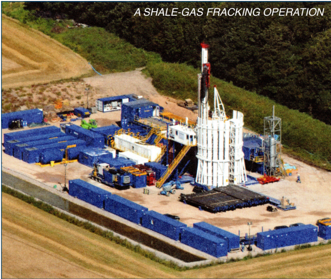
A SHALE-GAS FRACKING OPERATION

logical monitoring and evaluation of operations are required to identify those settings in which shallow groundwater is more susceptible to degradation. Addressing this will require improved cooperation and joint research between hydrogeologists and hydrocarbon reservoir engineers.