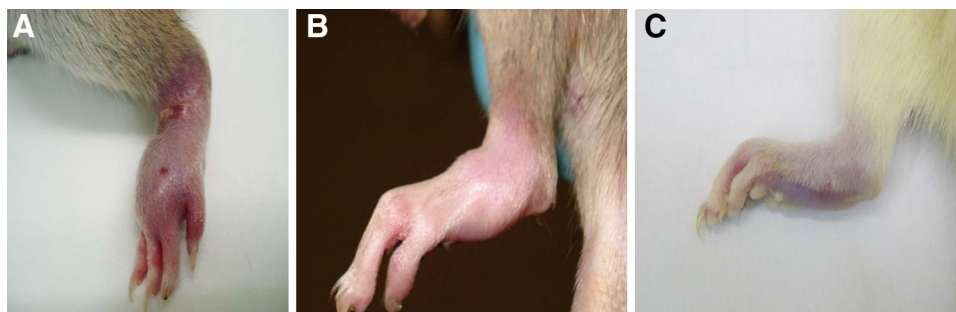
Fig. 2 Appearance of rat hind paws with arthritis following different doses of pristane. a Note swelling, redness and start of skin lesions. b Ankylosis at the chronic phase; histology shows active inflammation. The animals shown in a and b reached the humane endpoint and

The humane endpoints for each study will depend upon factors including its aims, the stage at which sufficient data are obtained, and sometimes whether a predetermined