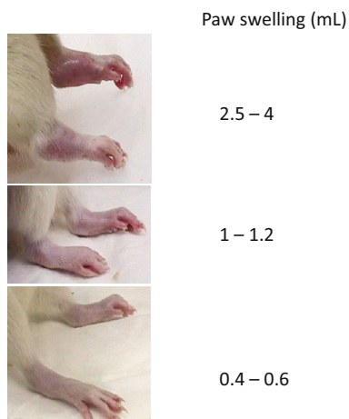
Fig. 1 Degrees of paw swelling in FCA adjuvant arthritic rats, measured using plethysmography. This illustrates significant, but well controlled, paw swelling to 2.5 mL. Volumes above this are likely to cause severe pain and debilitation and should be considered a humane end point, as in the top paw .

Infrared thermography (using a video camera) has been suggested to monitor clinical severity, as foot temperature