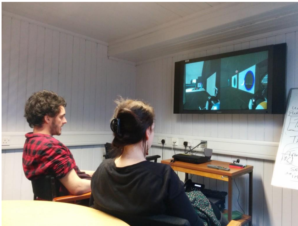
Figure 4: Split-screen cooperative play in Portal 2

Valve's much-loved Portal 2 was, perhaps, one of the more obvious commercial games to play as part of a project that looks at communication and collaboration skills, as it features a particularly robust and inventive cooperative mode. From a practical point of view, it is also worth noting that the cooperative portion of the game allows for split-screen play, meaning two people can play together on the same machine without the need for a solid internet connection to the PlayStation Network (an impossibility due to our institutional firewall).