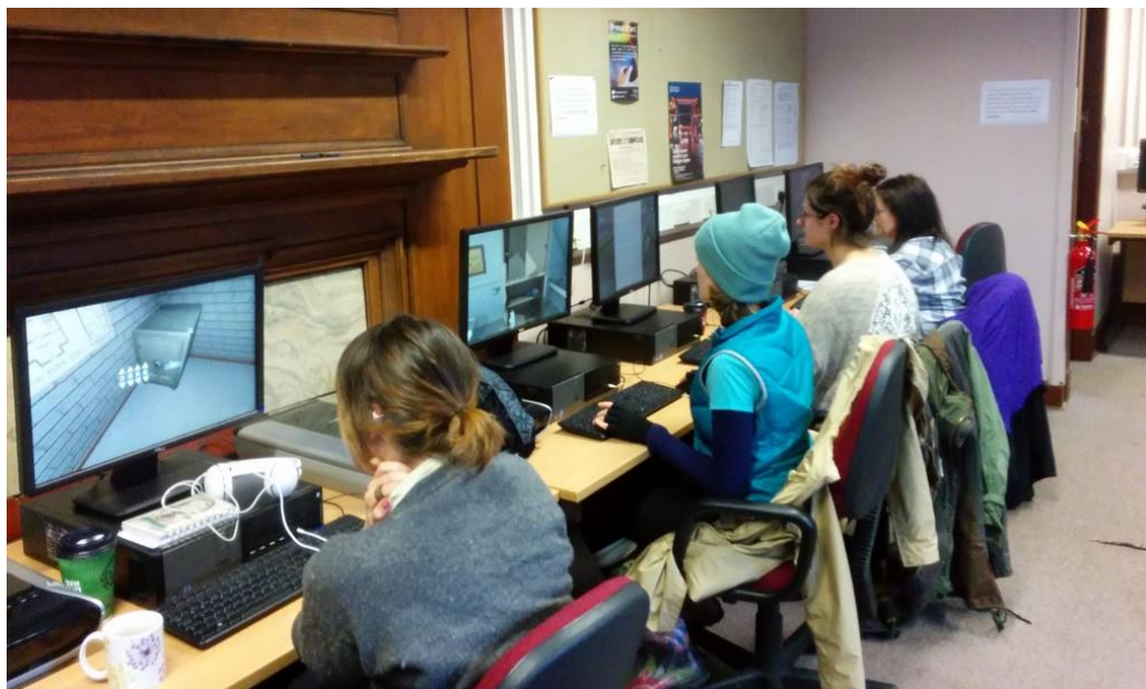
Figure 2: Investigating The Fullbright Company's Gone Home .