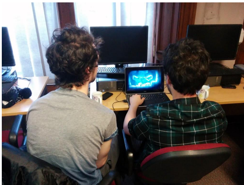
Figure 3: Cooperative play in Never Alone .

As a recent release, Never Alone was the first game that none of our project volunteers had played before, and it was well-received across the group. Most of our players took the time to watch the documentary footage and interviews with the Iñupiat elders that intersperse the game. Furthermore, engaging with these materials was generally deemed to have been interesting and worthwhile: the players learned something of Alaskan native culture as they played and, in at least one instance, garnered gameplay hints from the interview material. Those players who habitually skipped the videos were driven by a desire to complete more of the game than their peers but conceded that, had this element of competition been absent, they would have taken the time to watch. Indeed, the relatively unobtrusive nature of the video material, coupled with a strong underlying game concept, was thought to create opportunities for learning about Iñupiat culture without compromising on fun.