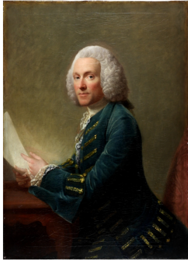
Figure 1. Portrait of William Hunter by Allan Ramsay, 1764-65