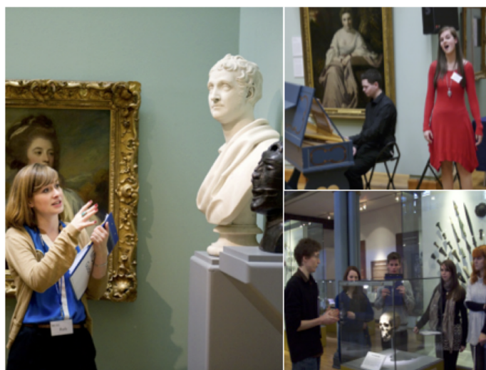
Figure 4. Student engagement opportunities at the Hunterian

The project also offers a unique opportunity for involving the students in aspects of the research and also the other way round, feeding directly the results of the research in updated teaching components, particularly to the very successful MSc in Museum Studies course.