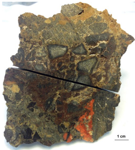
Figure 3: Photo of clean-cut face of polymict lithic breccia dyke.

is the continuous unit of polymict lithic breccia from where this dyke is believed to have originated. Lithologic description: A mixture of angular clasts of country rock are found within a fine-grained clastic matrix containing coarse to fine-crystalline secondary carbonates and bright red, coarse crystalline K-feldspar. Clast descriptions are as follows: (i) dark-grey, angular, 2 to 3cm clasts of amphibolite gneiss displaying high temperature reaction rims of dark red K-feldspar (figure 1 and 3), (ii) light-grey, 2 to 4cm sub-angular clasts of granitic plutonic and metamorphic basement, also displaying high temperature dark grey-red reaction rims, with phyllosilicate-rich interiors and (iii) 5mm to 1cm sub-angular quartz grains.