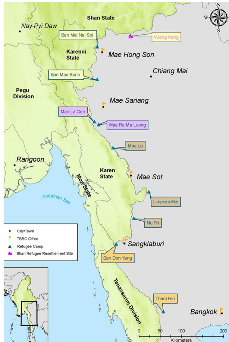
Figure 1 Refugee Camps along the Thailand-Myanmar Border (Image reproduced with permission from the Thailand Burma Border Consortium).

and time to the nearest Thai Hospital varies between camps (30 mins to 8 hours) and according to the condition of roads, which deteriorate during the rainy season. Health care in Mae La is provided by Non-Governmental Organisations (NGOs) – initially by Médecins Sans Frontières (until 2005) and subsequently by Aide Médicale Internationale (AMI). The refugee situation in Mae La Camp is stable and the majority of morbidity is associated with infectious and chronic diseases; while war trauma and reproductive health problems exist, these are comparatively minor. One of the principle health issues is multi-drug resistant Plasmodium falciparum malaria – however significant improvements in this area have been made due